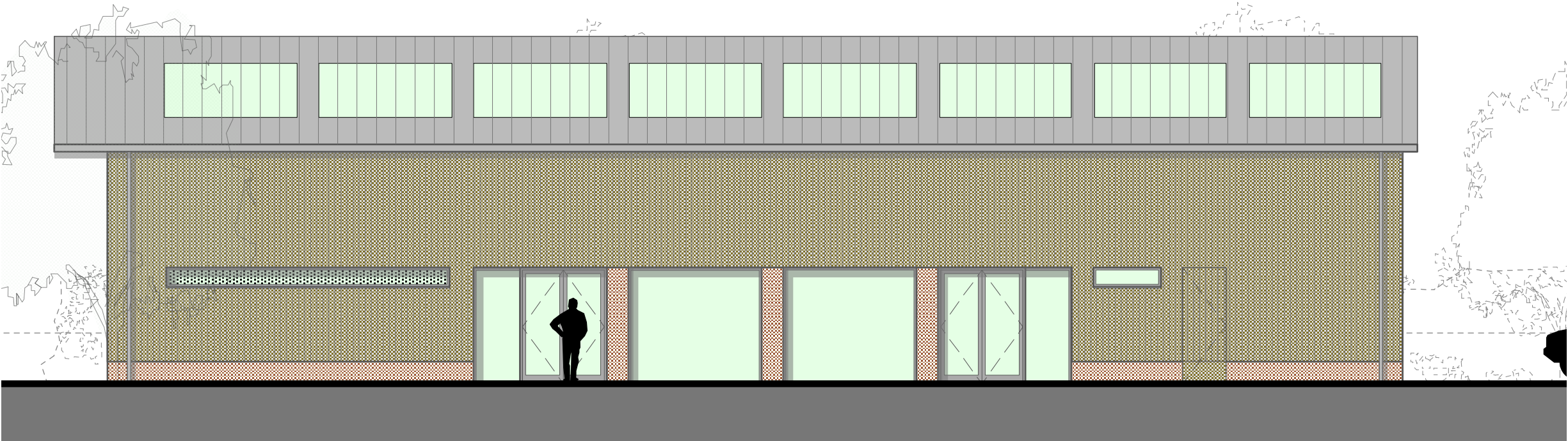
north west elevation